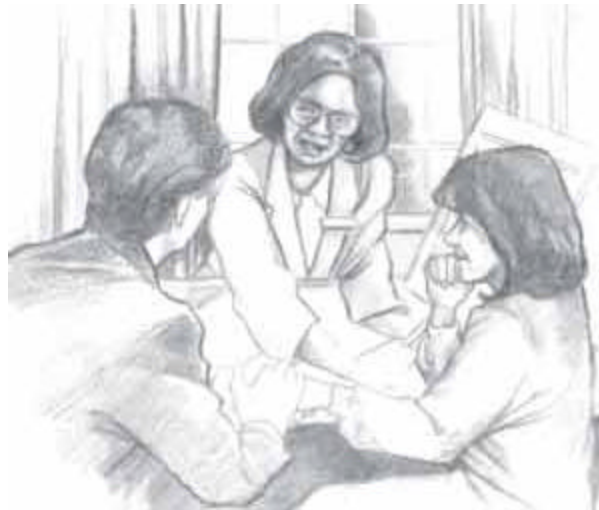
The doctor will ask about medical history.

To diagnose diverticular disease, the doctor asks about medical history, does a physical exam, and may perform one or more diagnostic tests. Because most people do not have symptoms, diverticulosis is often found through tests ordered for another ailment.