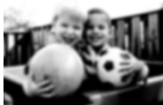
The same scene as viewed by a person with cataract